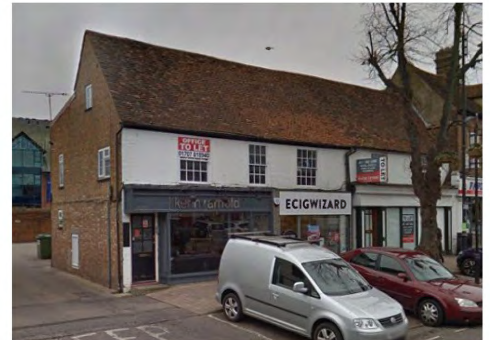
Fig. 4.3: The Grade II listed Nos.92 and 92A High Street (Google Street View, 2020).