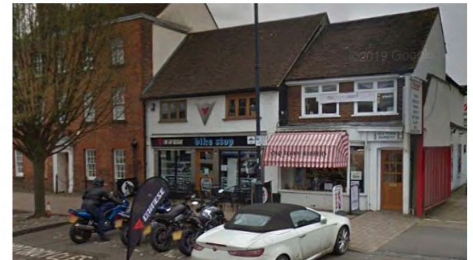
Fig. 4.4: The Grade II listed No.104 High Street in the middle of the photograph.