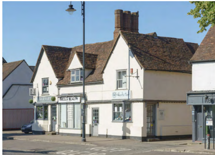
Fig. 4.1: The Grade II* listed Nos.94-98 High Street.