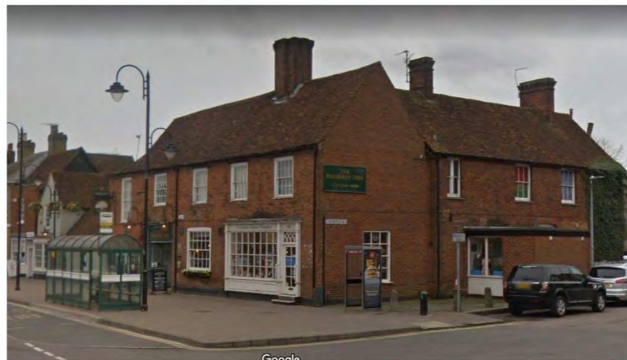
Fig. 4.2: The Grade II listed No.60 High Street.