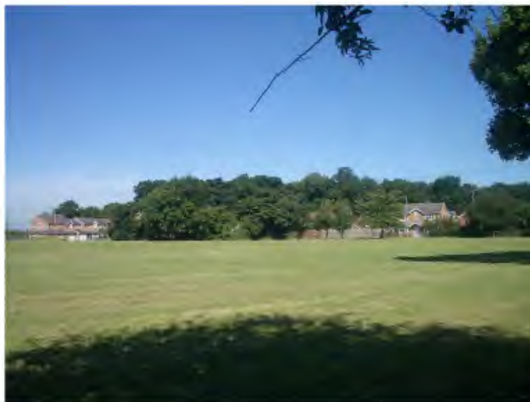
Canterbury Playing Fields

8.10 For sports facilities on school sites, there will be a need to agree to a Community Use Agreement to ensure that local communities can benefit from the facility and have access to it in evening and at weekends. Often this will be secured by S106 agreement, but for minor schemes where there are no other requirements for a S106 this should be secured via planning conditions.