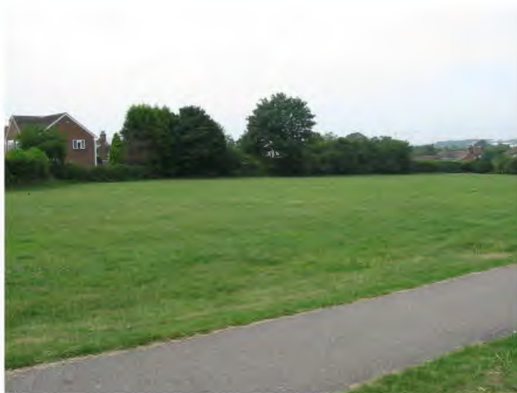
Stevenage Open Space

8.5 Where a development cannot meet the open space standards, they will be expected to agree to provide a developer contribution through a S106 agreement to offset the under-provision on-site. The contribution will be used to provide the equivalent space elsewhere in the borough, or to fund improvements to existing open space to ensure it meets the additional burden on it from the new resident population.