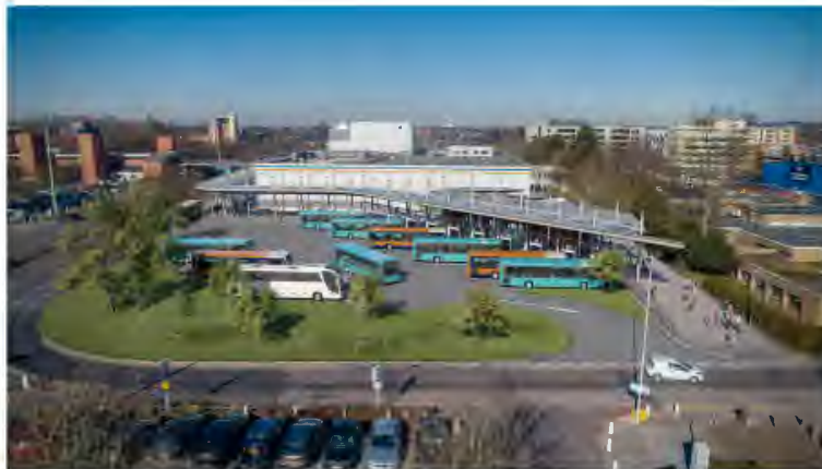
Proposed Town Centre Bus Station

9.15 Sustainable transport links include creating appropriate access for residents or other users to use active modes of transport, such as cycling and walking, as well as public transport such as, buses and trains. Ideally, developments will be designed to ensure that these forms of transport are attractive enough to persuade their use instead of the use of privately-owned cars. This is to match the Policy 1 of HCC's Local Transport Plan to promote a modal shift in transportation. It should be noted that the top of the Hierarchy is to prevent the need to travel in the first place which will be considered in the first instance, and active and sustainable forms of transport should be considered thereafter.