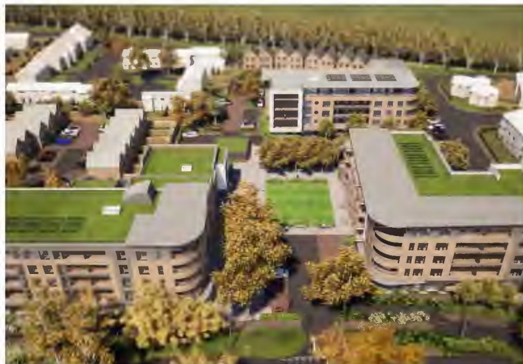
Affordable Housing as part of Kenilworth Road Scheme

7.4 Whilst Policies HO8 and HO9 give an indication of the type and tenure of affordable housing units being provided, the Council's Housing Team should be consulted to ensure the affordable housing being provided contains an acceptable range of types and size of unit that suits up to date demand.