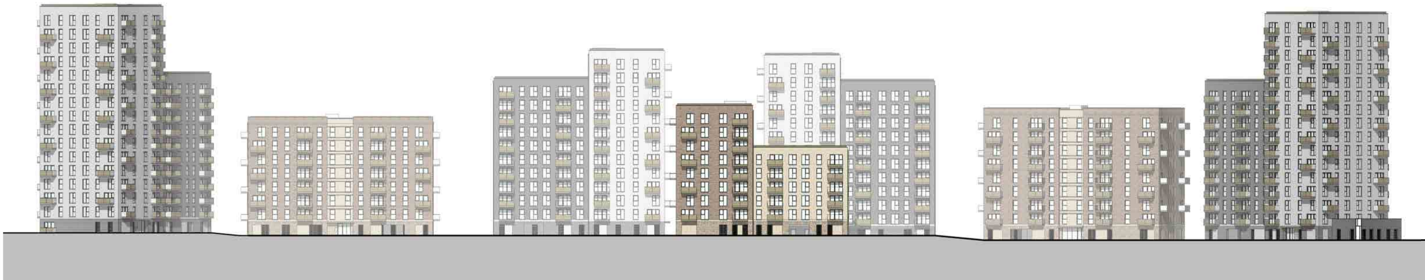
Site Elevation 02 (view from Railway)