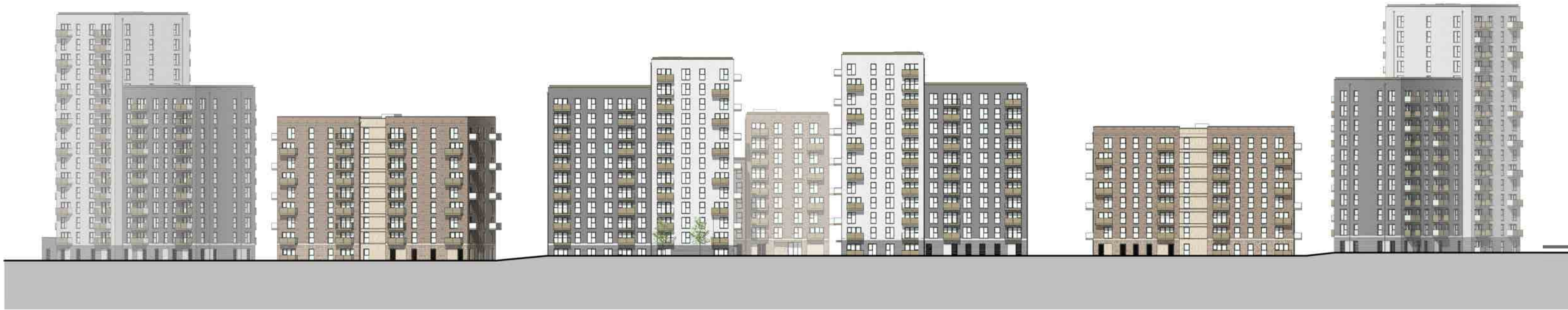
Site Elevation 01 (view from Lytton Way)