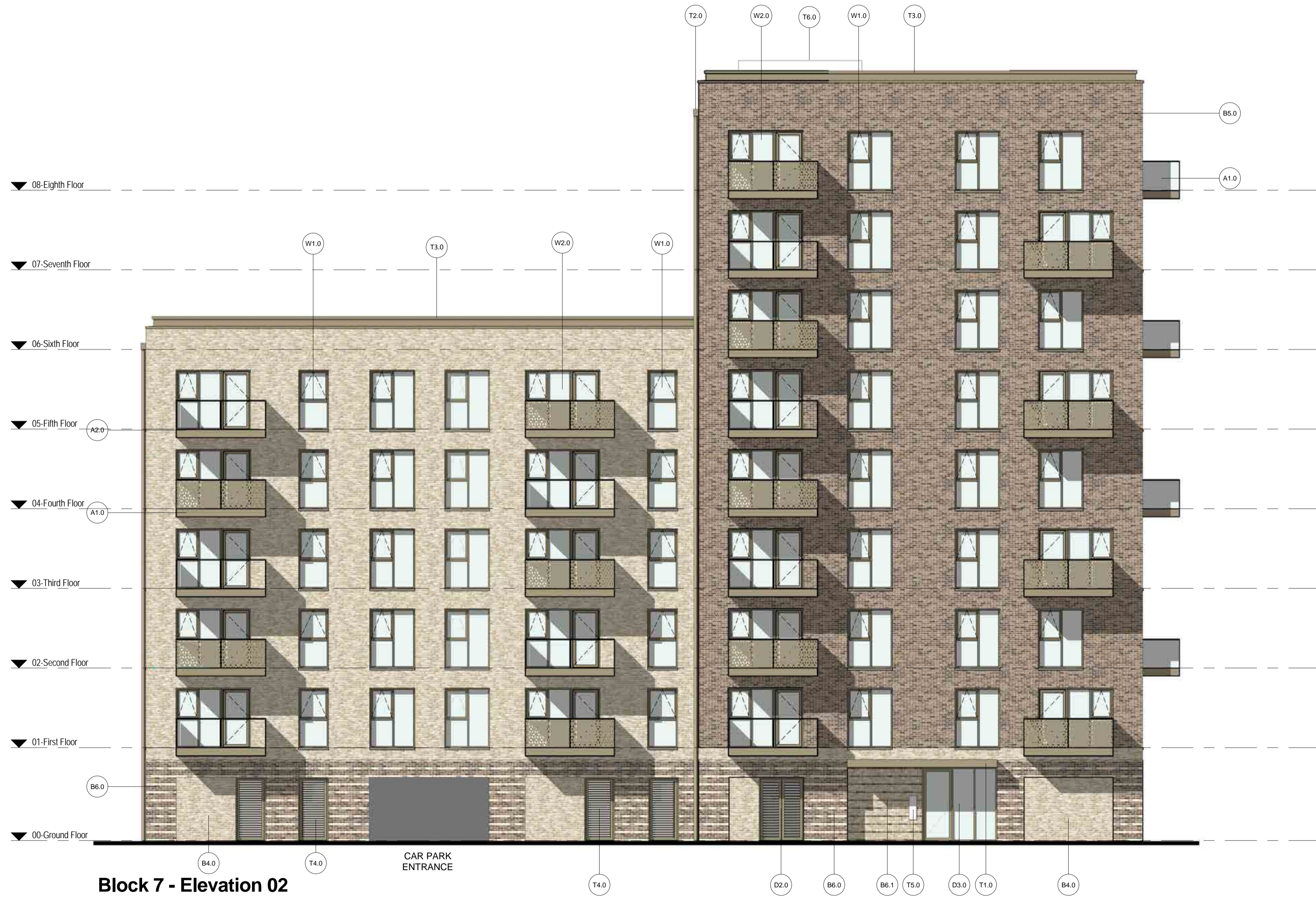
Block 7 - Elevation 02 1 : 100