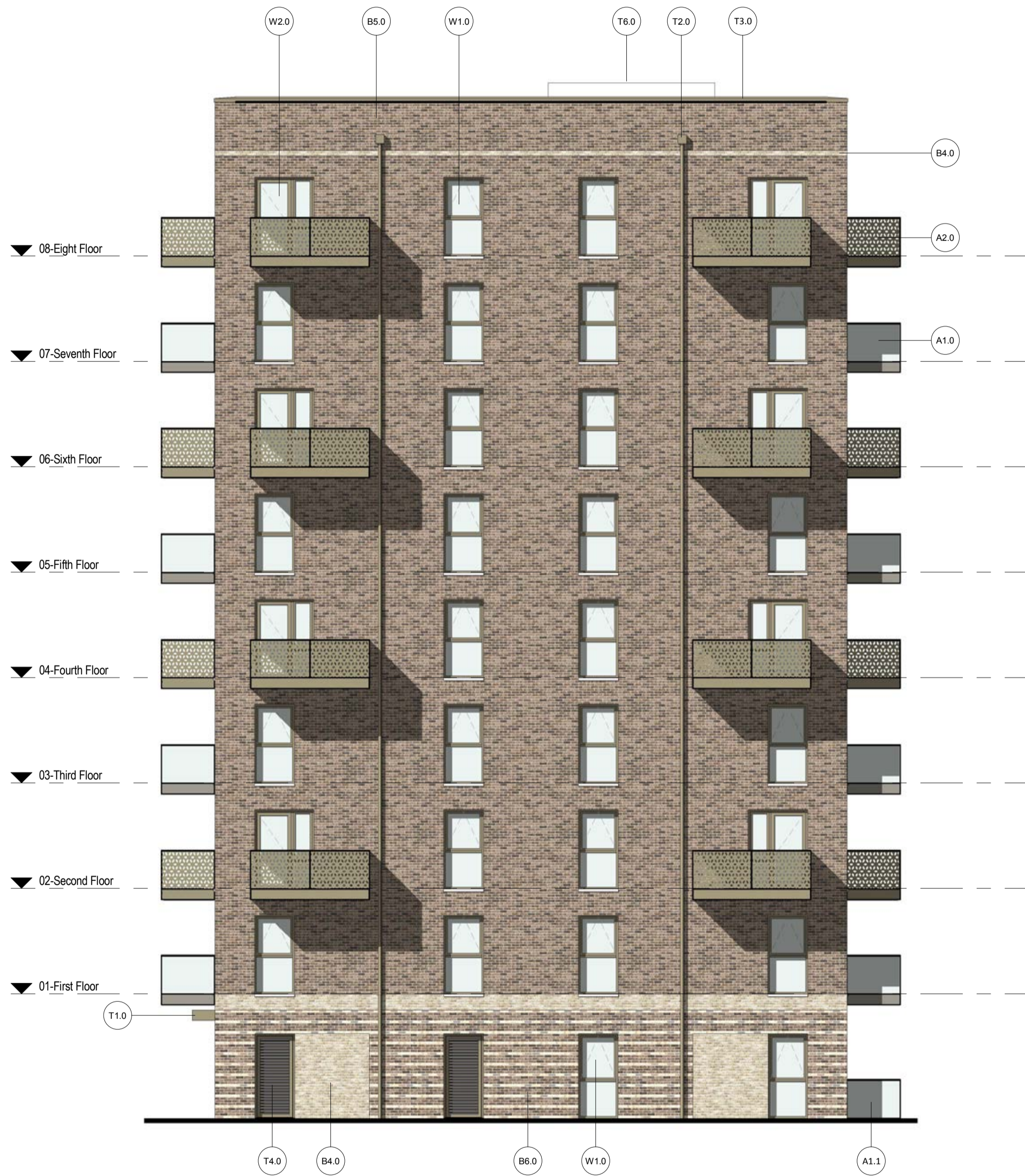
Block 5 - Elevation 03 1 : 100