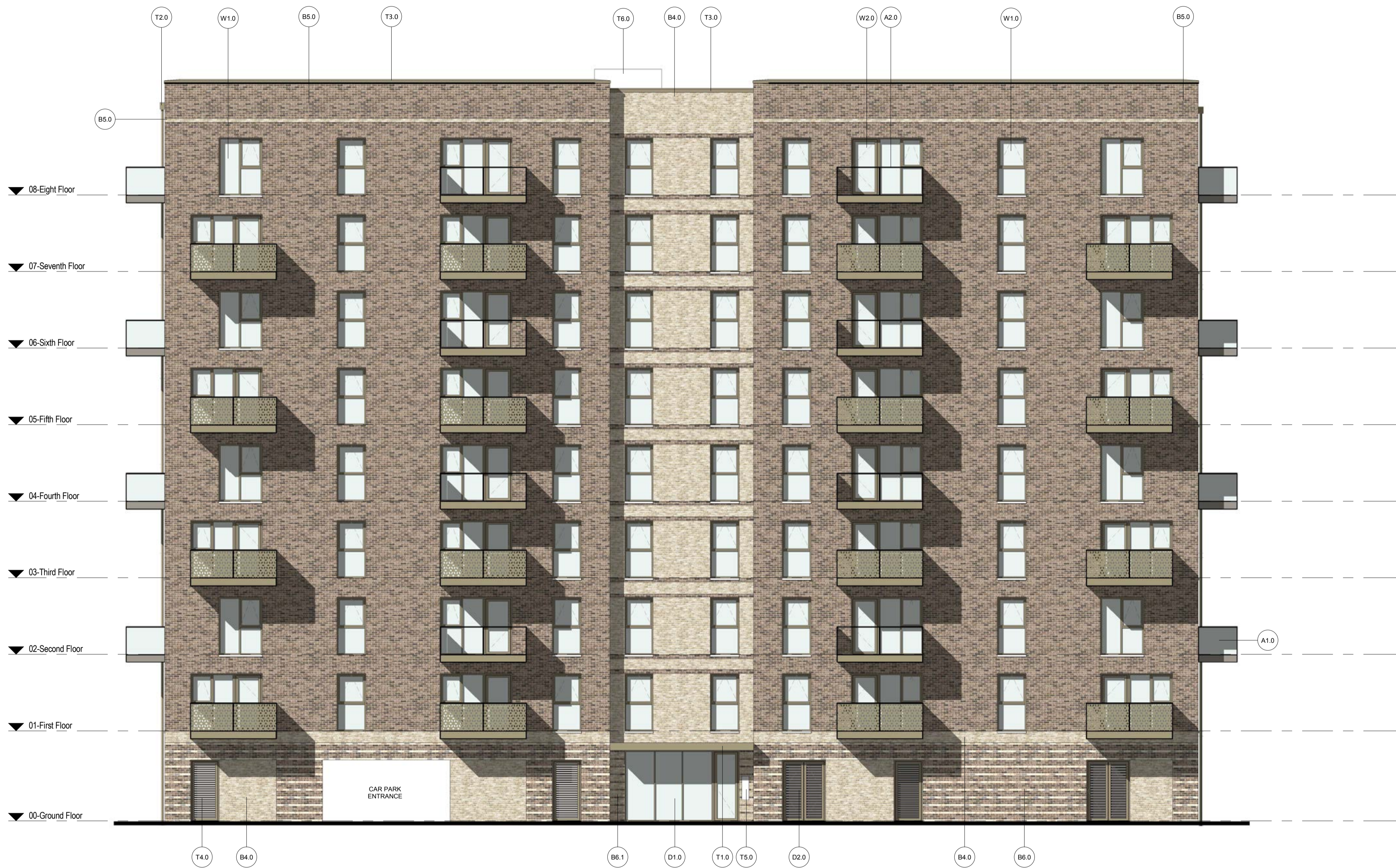
Block 5 - Elevation 02 1 : 100