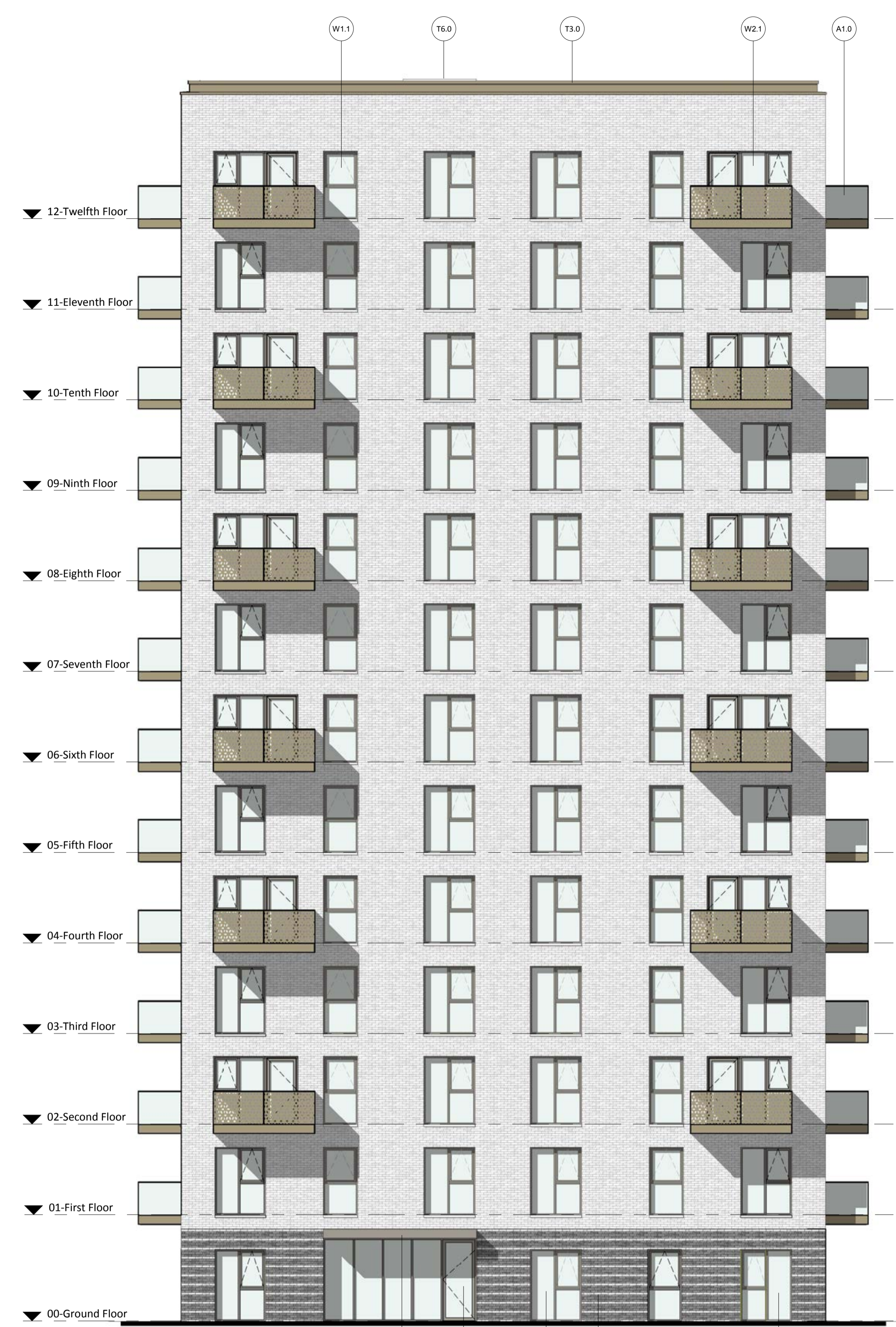
Block 4 - Elevation 03 1 : 100