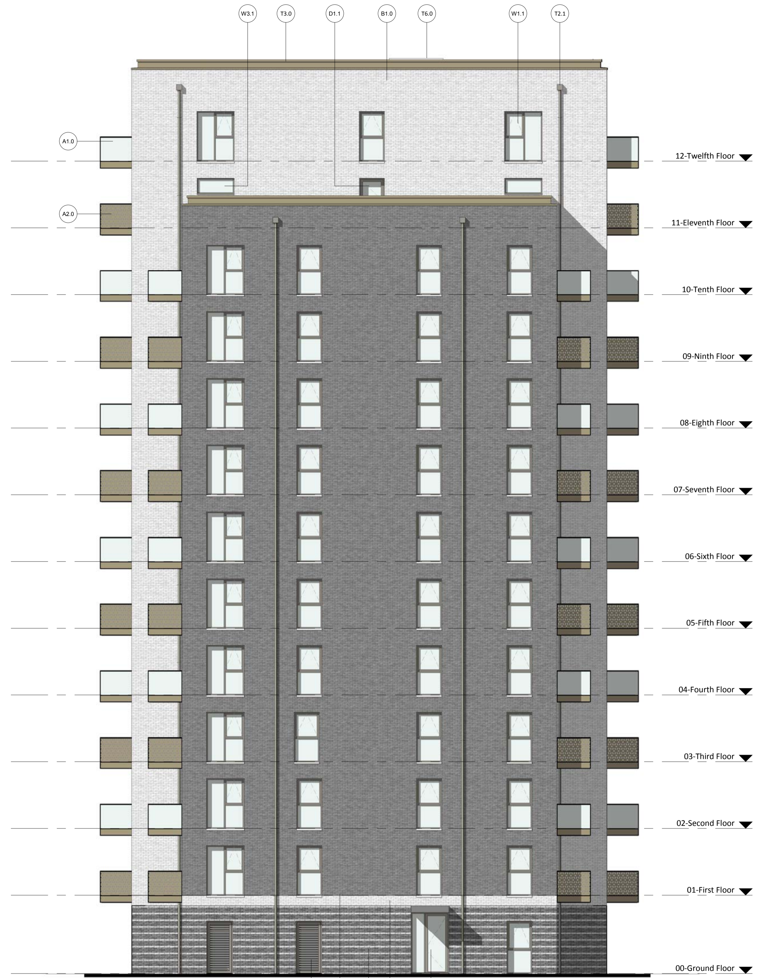
Block 4 - Elevation 04 1 : 100