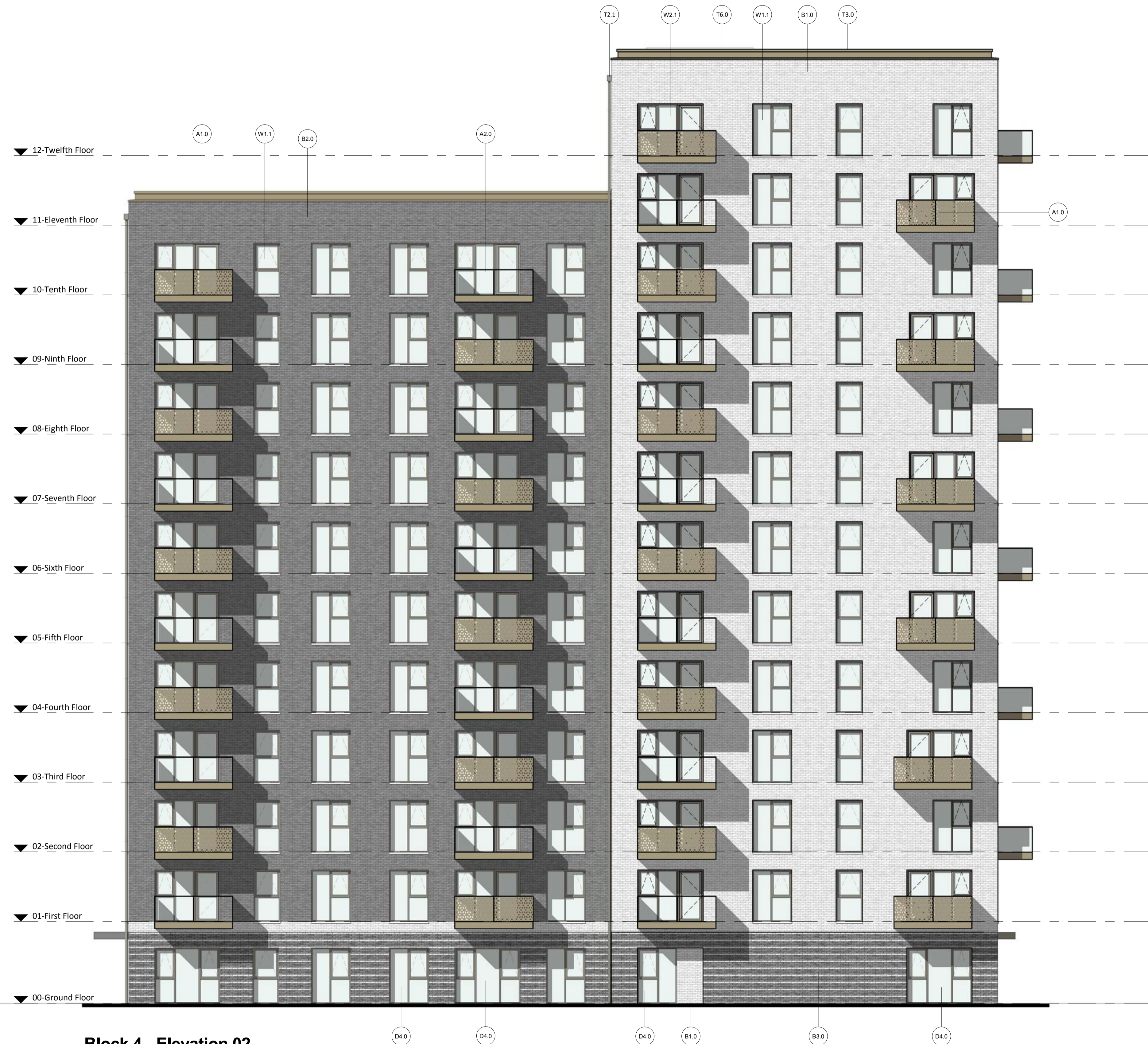
Block 4 - Elevation 02 1 : 100