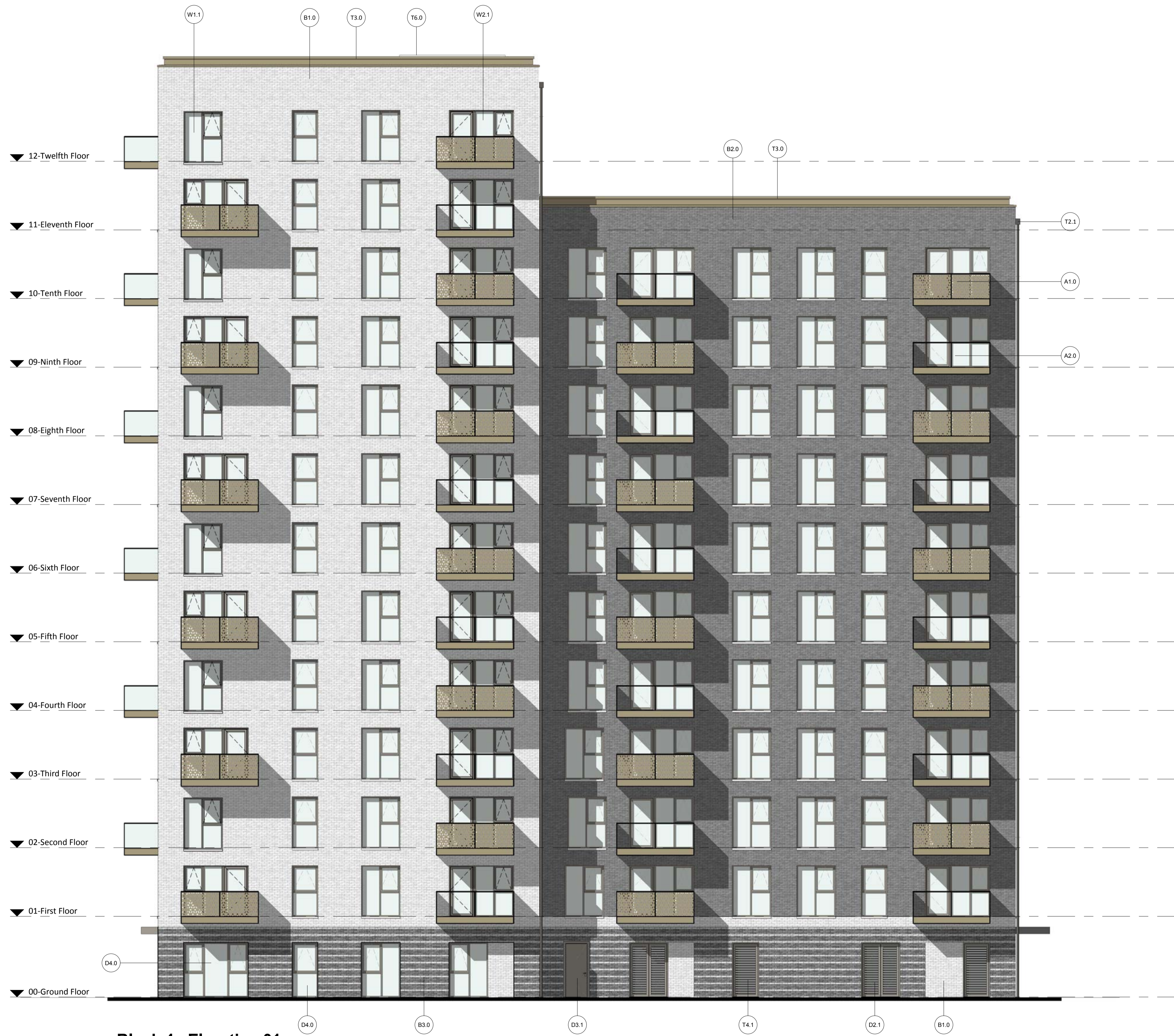
Block 4 - Elevation 01 1 : 100