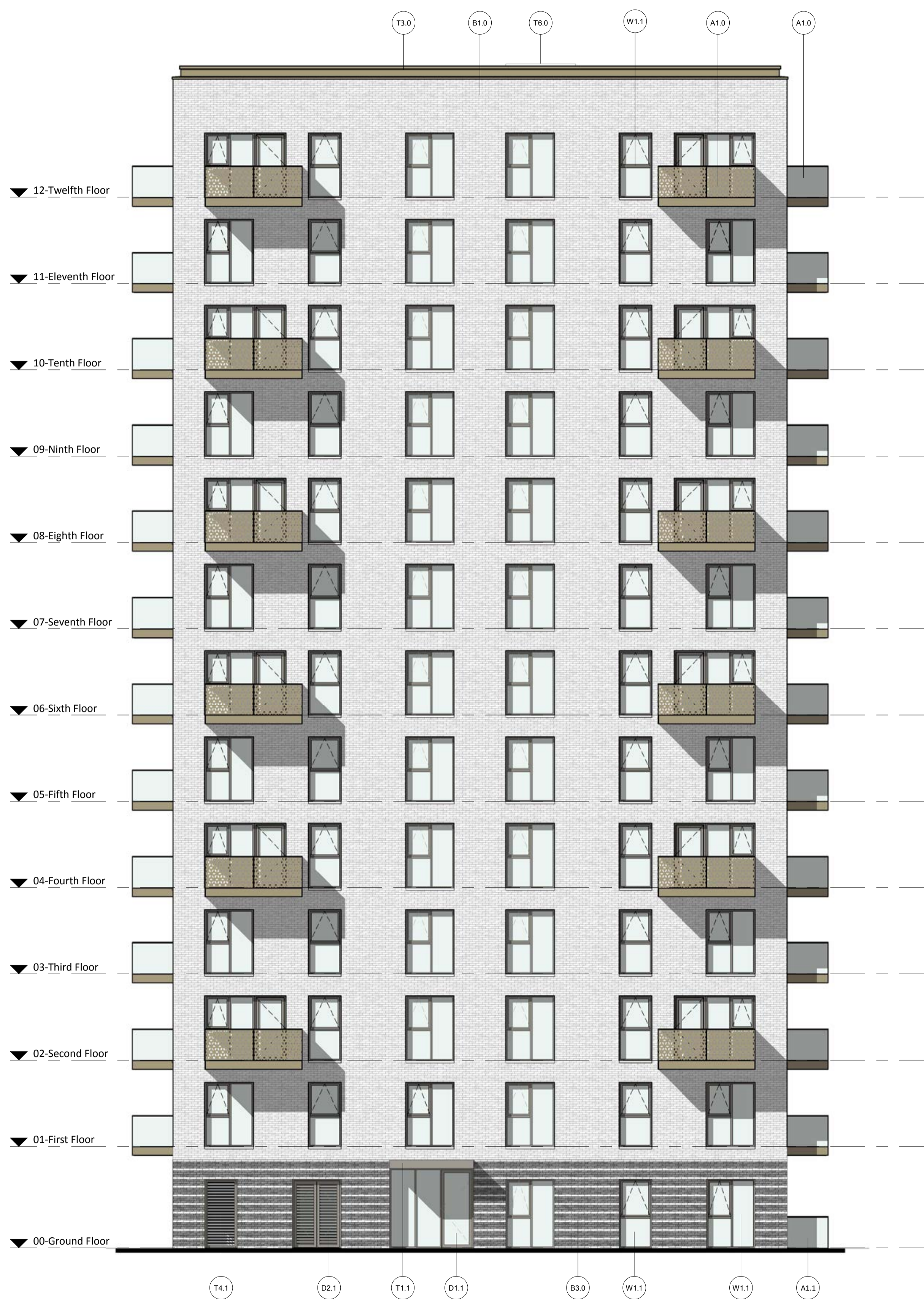
Block 3 - Elevation 03 1 : 100