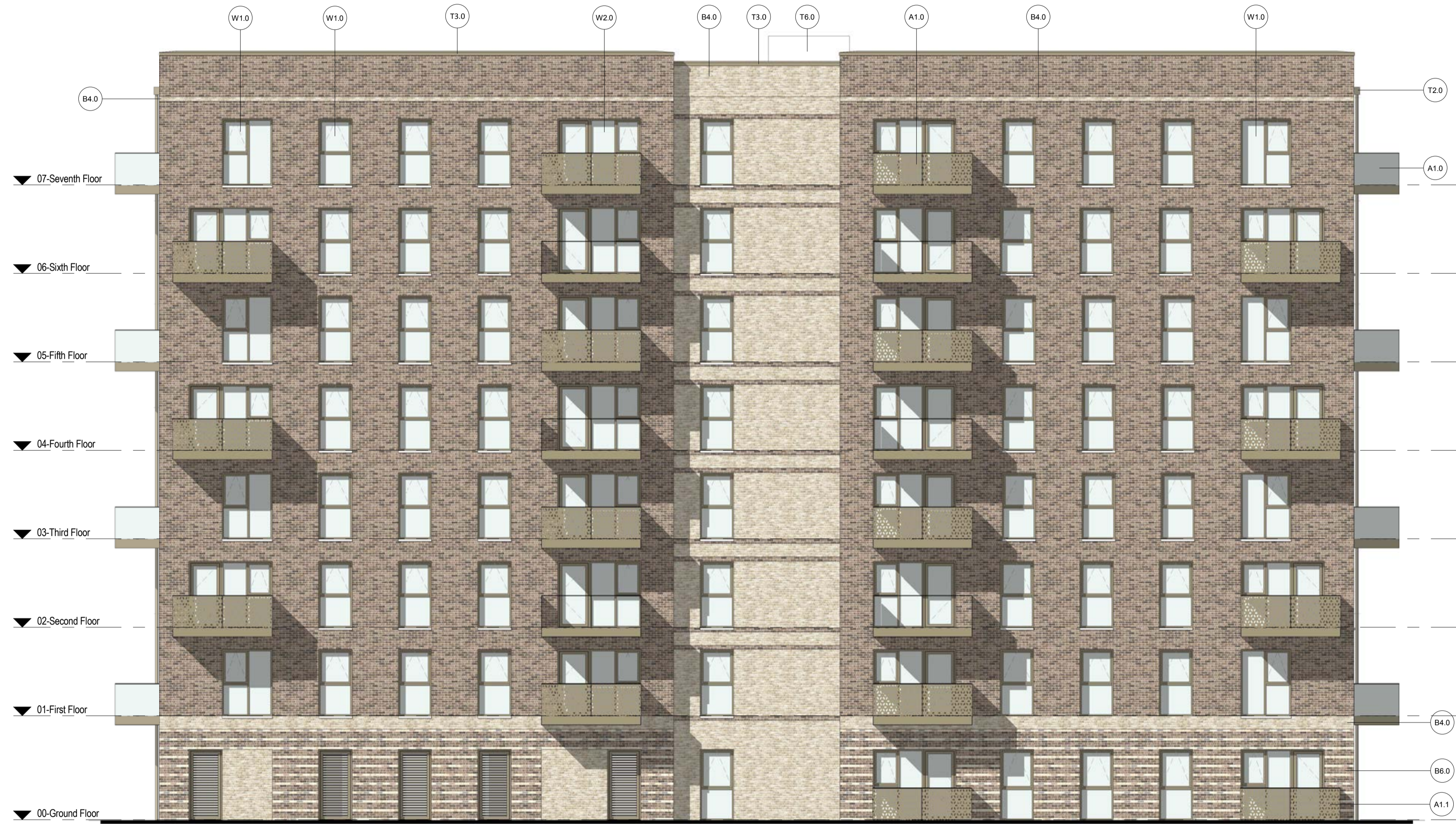
Block 2 - Elevation 02 1 : 100