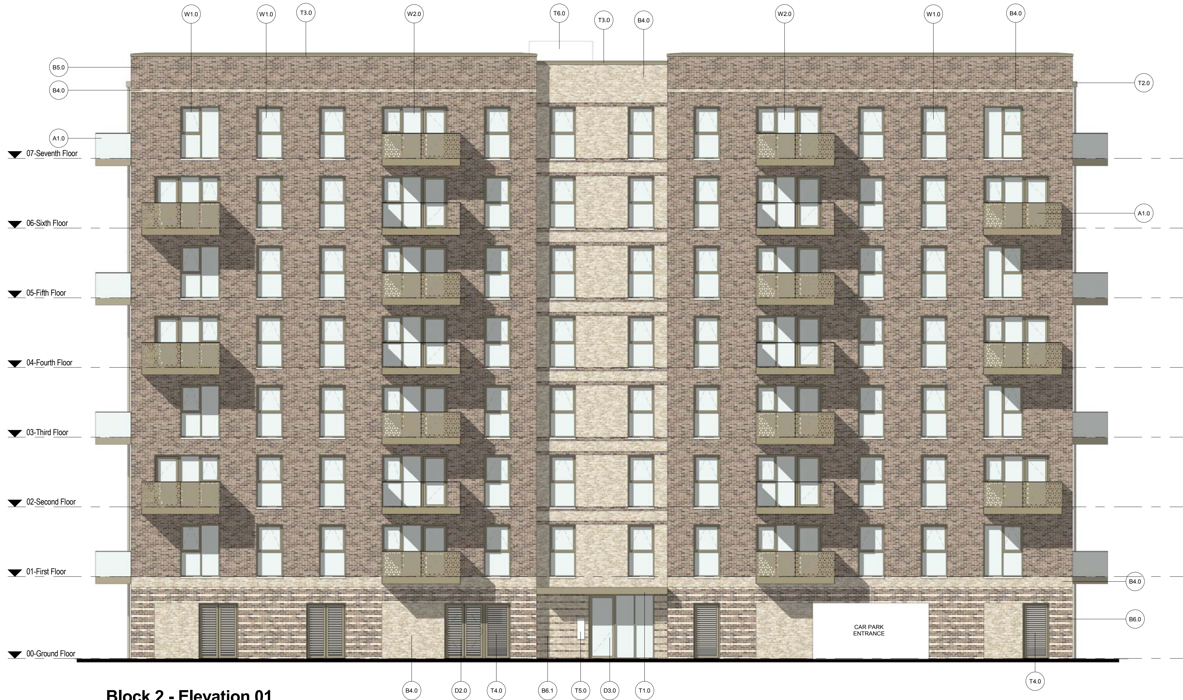
Block 2 - Elevation 01 1 : 100