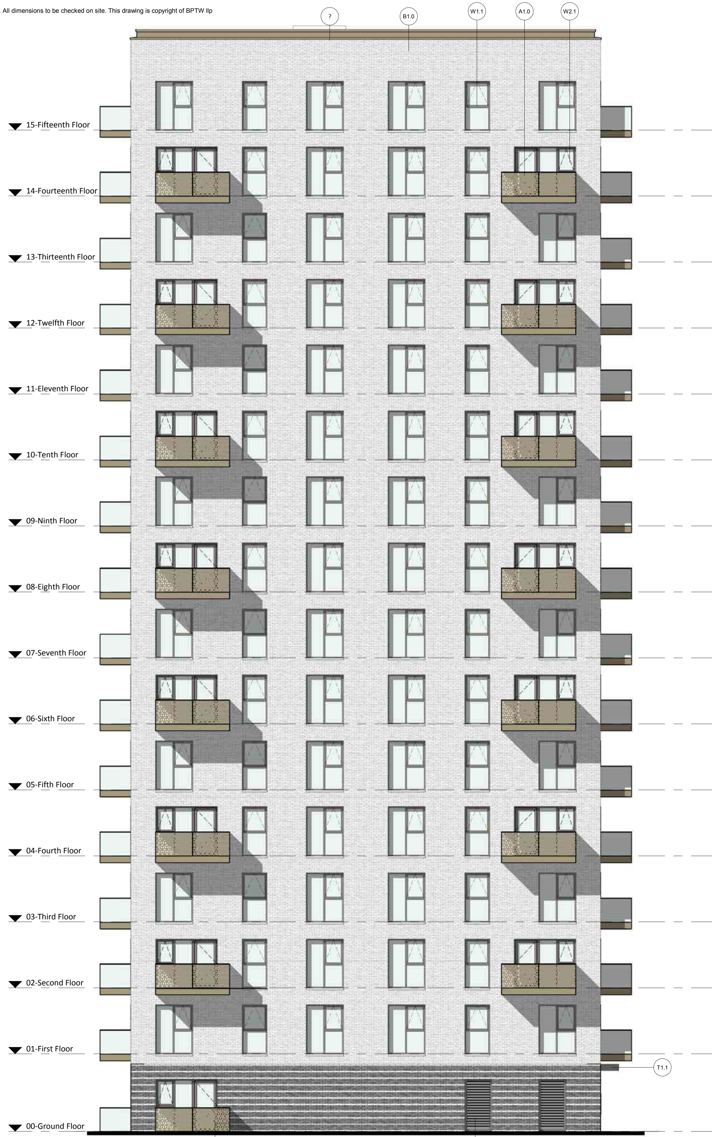
Block 1 - Elevation 03 1 : 100