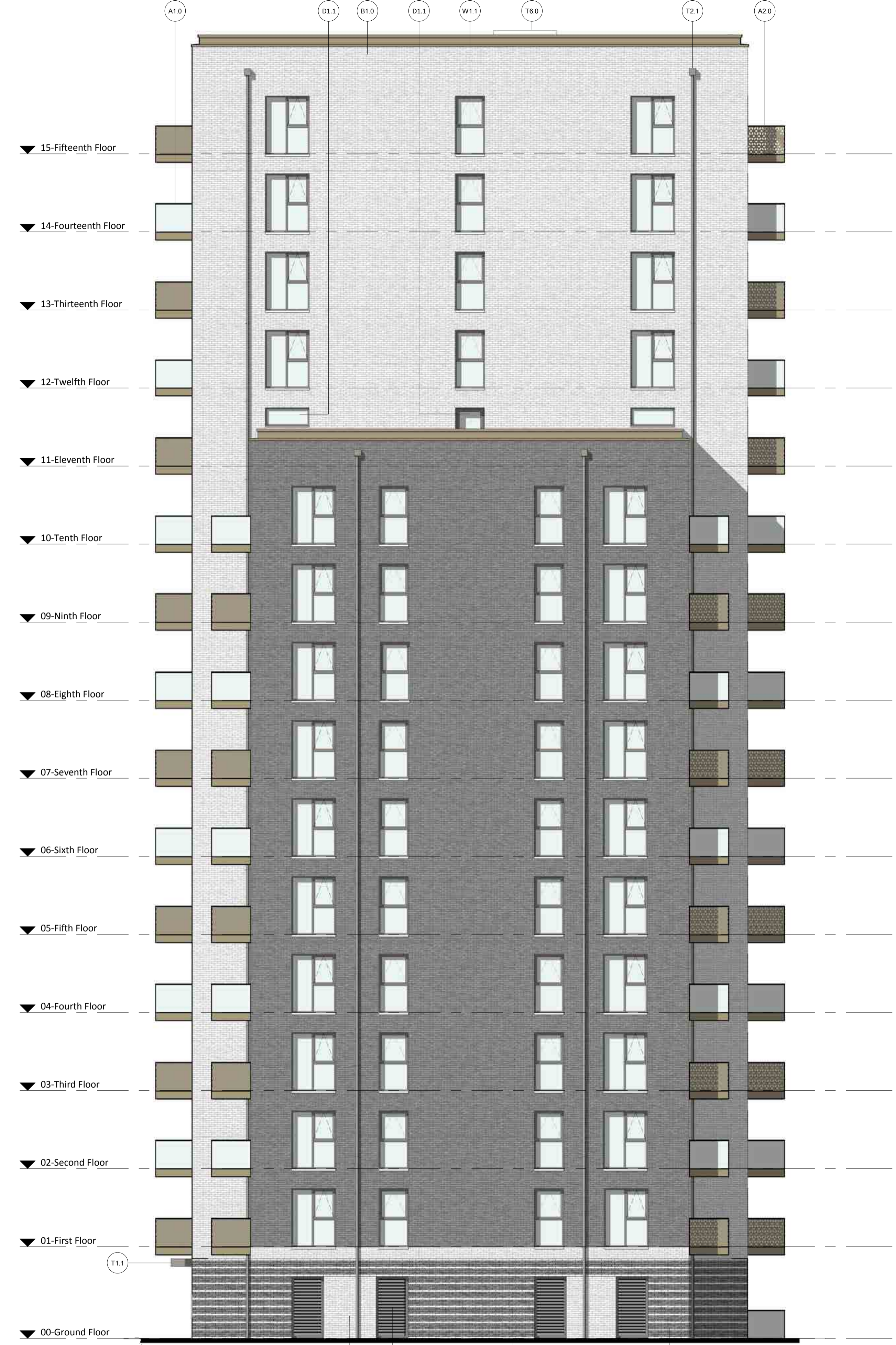
Block 1 - Elevation 04 1 : 100