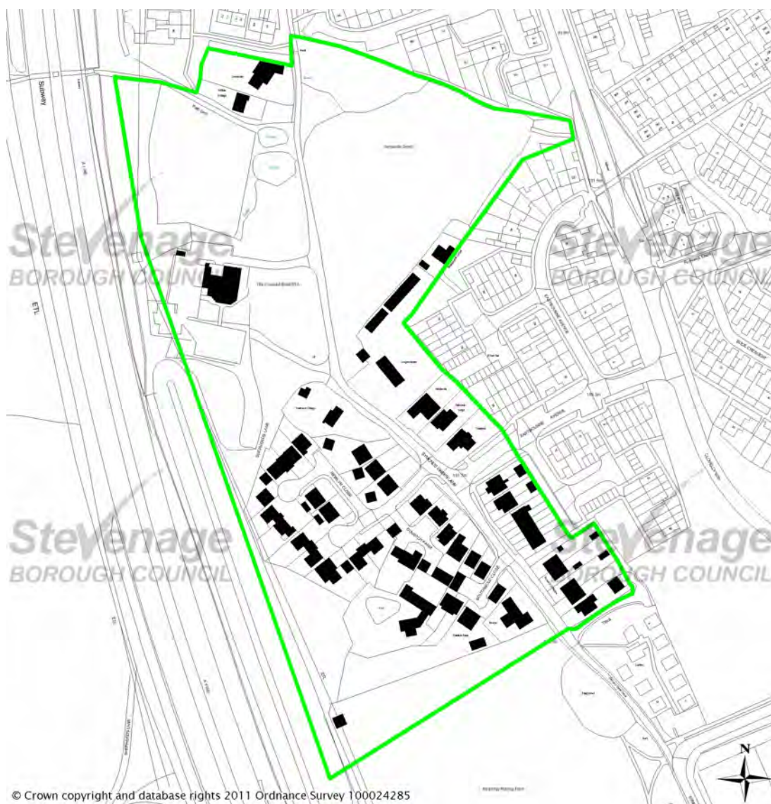
Figure 10 The built form of Symonds Green Conservation Area