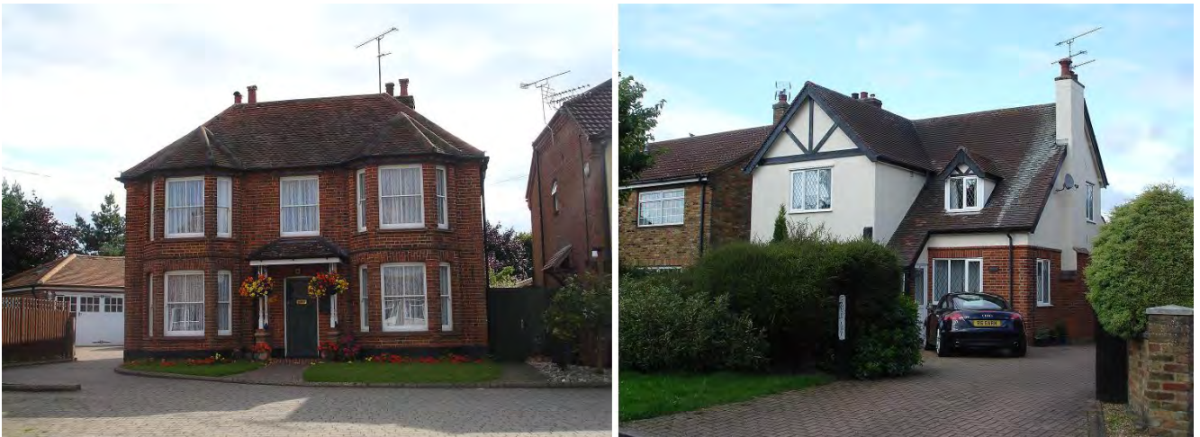
Figure 11 A hipped roof at Oakfield Farmhouse (l) and a gabled roof at Symonds Lodge (r)

9.8 The roof is one of the most important parts of a property as it makes the building wind and watertight and can bring harmony to a landscape. The majority of the houses within the Symonds Green Conservation Area are two storey, with both hipped and gabled roofs.