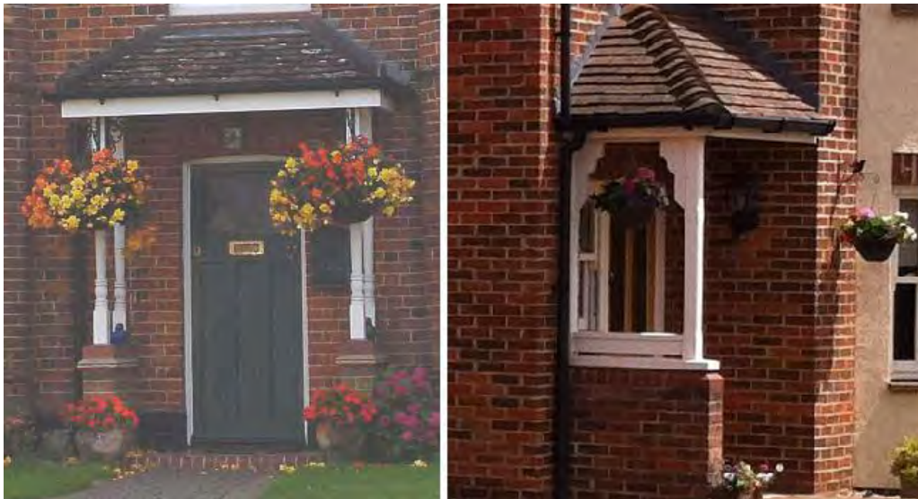
Figure 13 Modern porches (r) can successfully immitate more traditional designs (l)

9.15 Various sources offer guidance when dealing with the maintenance or restoration of period homes. English Heritage provide a great deal of information on heritage protection and understanding your property. It is recommended that you engage professional help to manage a project, such as an architect or building surveyor. Only a small proportion of qualified professionals specialise in the repair of old buildings. English Heritage offer advice on how to determine the most appropriate tradesperson for your property. See www.english-heritage.org.uk for further details.