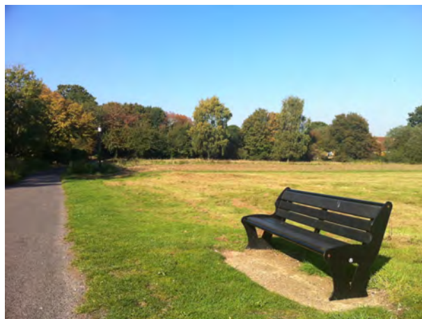
Figure 15 Symonds Green

9.28 We will continue to support the use of light fittings which are appropriate to their location in terms of material, scale, design and illumination, particularly for listed buildings and conservation areas.