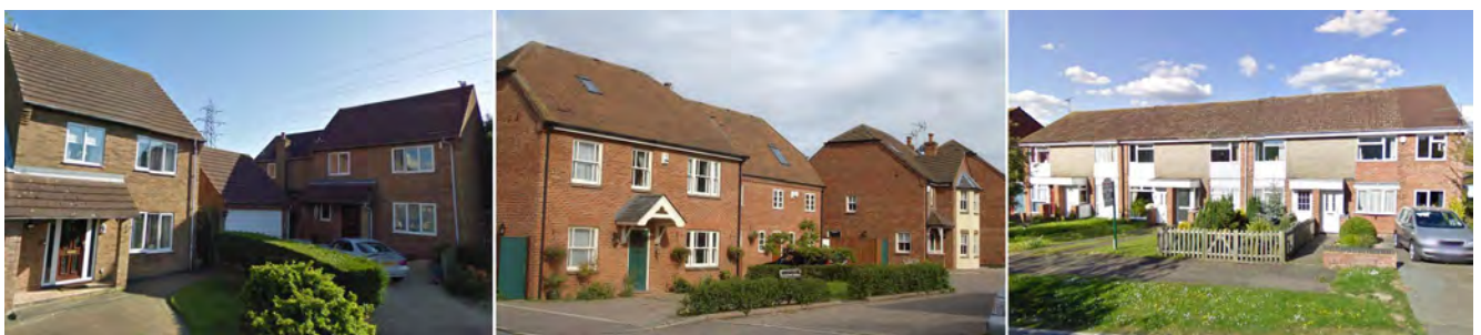
Figure 6 Newlyn Close (l), Dunwich Farm (c) and Symonds Green Lane (r)

5.7 In the latter half of the 20th century, Newlyn Close, Dunwich Farm and Southwold Close developed towards the south west of the area. There are also examples of New Town housing along Symonds Green Lane. Figure 6 illustrates some of the properties in this part of the conservation area.