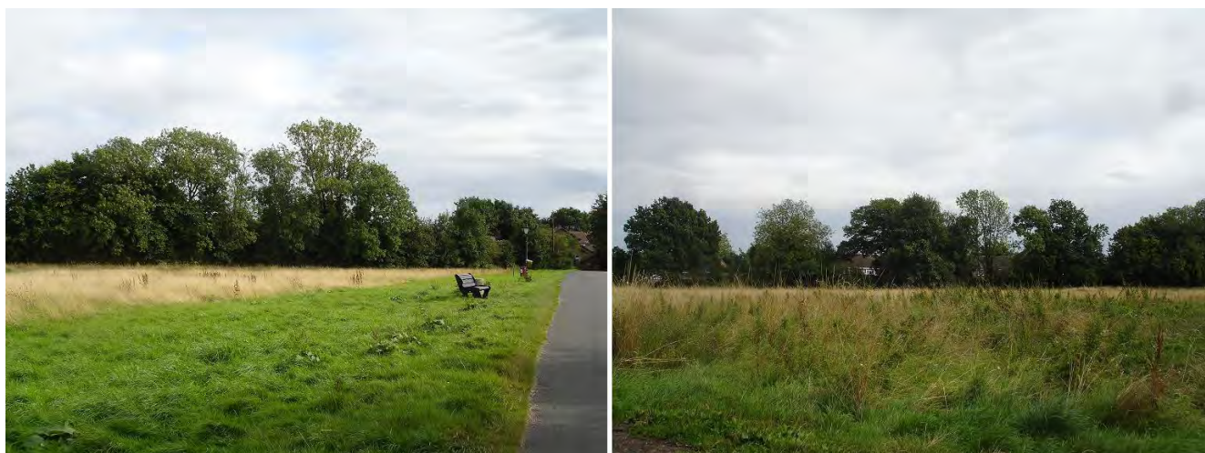
Figure 14 Symonds Green

9.22 The continued maintenance of this area will be monitored by the Council and emergency ad-hoc works will be completed as necessary. The area will otherwise be subject to a regular programme of maintenance.