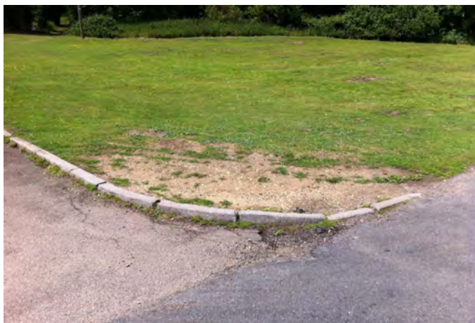
Figure 8 Erosion of the green

8.4 There is evidence of erosion of a small part of the Green, where the lane leading towards the public house meets Symonds Green Lane. This is likely to have been caused by vehicles driving over the green, and has created a negative visual impact. Figure 8 illustrates this issue.