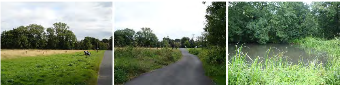
Figure 2 The green space in the Symonds Green Conservation Area

5.2 The conservation area is centred around the Green, which is made up of the common, the ponds and the Crooked Billet public house. These provide an attractive focal point to the area and effectively depict its rural character.