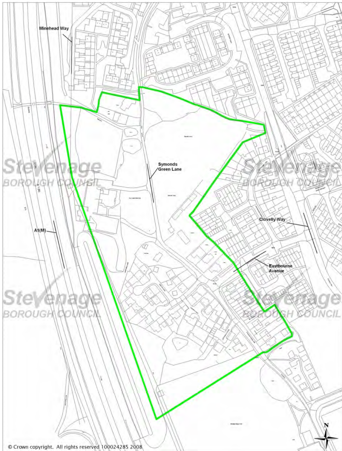
Figure 1 Symonds Green Conservation Area map (Green line denotes boundary)