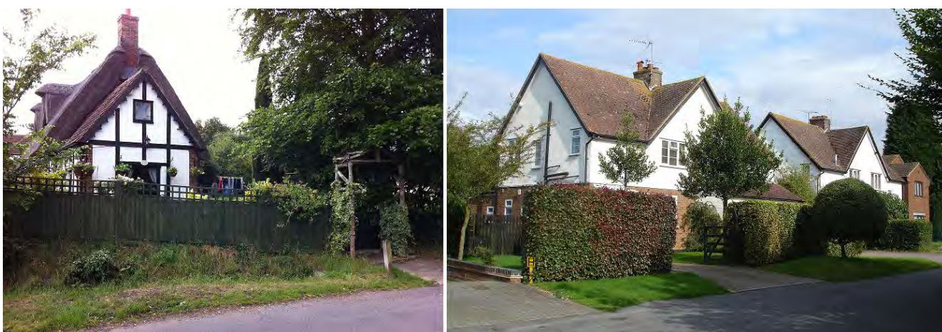
Figure 9 Thatched Cottage and the Nursery Cottages

9.2 Alterations and extensions should not dominate an existing building's scale or alter the composition of its main elevations. Any alterations, including partial demolition, should respect an existing building and its materials. All new work should complement the old in quality, texture and colour as well as method of construction. Walls and stone detailing which have traditionally not been painted should remain undecorated.