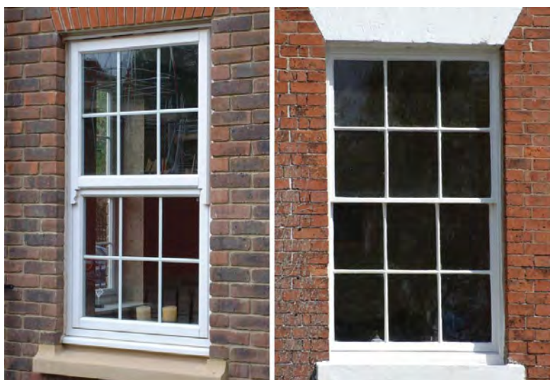
Figure 12 A uPVC (l) window is a much thicker frame than the traditional wooden frame (r)

9.12 Imitation replacement window styles and inappropriate replacement window materials are poor alternatives for traditional single pane, timber, vertical sliding sash windows. Mock sliding sash windows generally have heavy top opening casements for the opening section, whilst UPVC windows have thicker, cruder frames than timber windows. These unsuitable styles and materials impact on the proportions and overall appearance of a window and a building. The character of a building is then changed, which has a detrimental impact on the overall appearance of the conversion area.