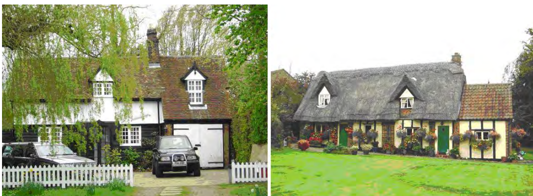
Figure 3 Willow Cottage (l) and Thatched Cottage (r)

5.4 A road which ran north from Old Stevenage to Titmore Green led to the development of housing in the 17th century. Willow Cottage and Thatched Cottage are still located at either end of the common today. Figure 4 illustrates the 1883 Ordnance Survey map with the approximate location of the conservation area boundary. Willow Cottage and Thatched Cottage are highlighted.