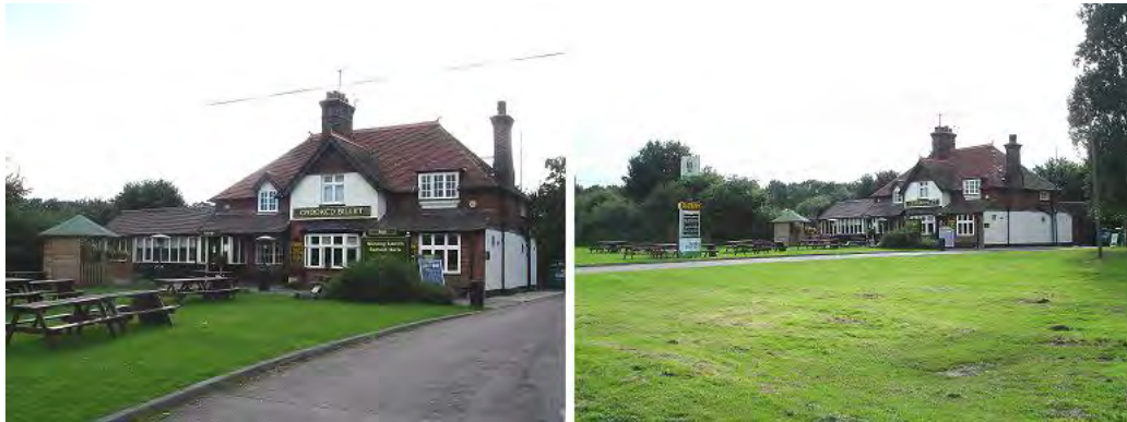
Figure 5 The Crooked Billet Public House

5.5 By the 19th century Fairview Farm (known later as Oakfield Farm) had developed. The barn is probably the oldest structure in the conservation area dating to the 16th or 17th century, before the farm was even established. The farmhouse is still on site. The Crooked Billet Public House was on the common from around 1841, although the current building dates to around 1920.