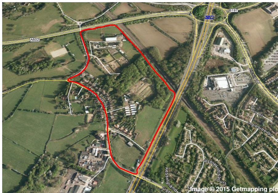
Figure 2.2 Aerial Photograph of Parcel W2(ii)

Figures 2.2 and 2.3 show the land use character of parcels W2(ii) (Figure 2.2) being a complex assortment of land uses including farm enterprises, rough grazing, woodland, brownfield land and storage, principally bounded by the A1(M), a railway line, Chantry Lane and the built edge of Todd's Green. Parcel N8(ii) (Figure 2.3), by contrast, is a mixture of woodland and scrub which is bounded by the A1(M) to the west, the B197 Graveley Road to the south east and a mature treeline to the north being the Borough boundary.