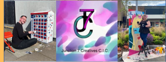
📍 Fairlands Way/Lytton Way West 💬 Pride 🎨 Junction 7 Creatives