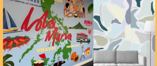
📍 Fairlands Way/Lytton Way South West 💬 Cultural and ethnic diversity 🎨 Pacifico Designs and MurWalls