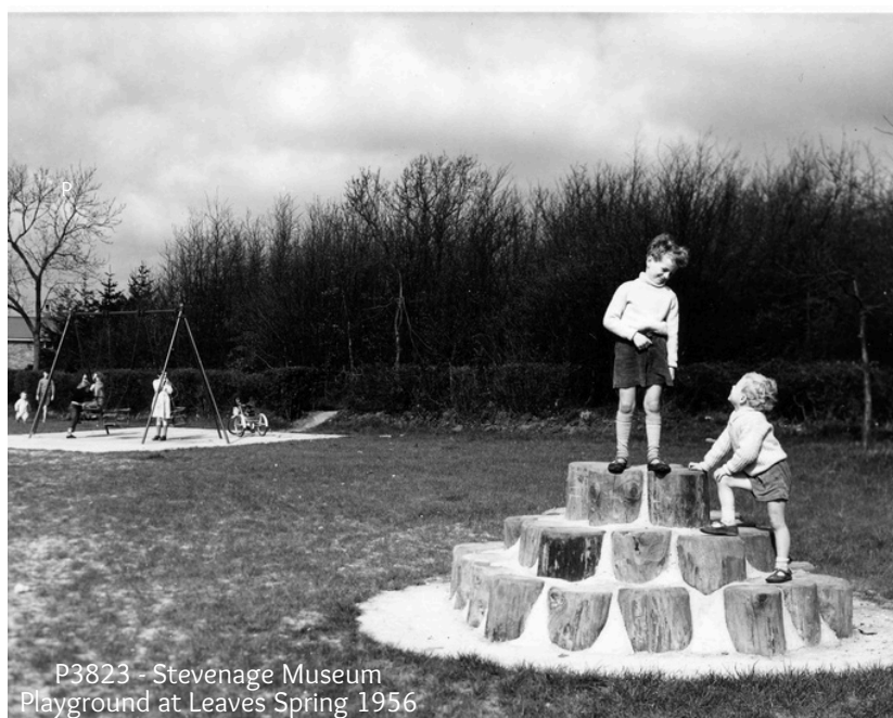
P3823 - Stevenage Museum Playground at Leaves Spring 1956