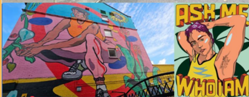
📍 Fairlands Way/Lytton Way East 💬 Women in Stevenage 🎨 Molly Hankinson Studio