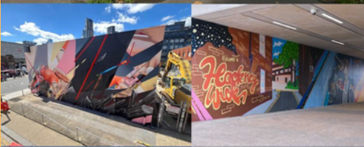
📍 Dewpond Close 💬 Remembrance and 📍 ICL 💬 Six Hills History