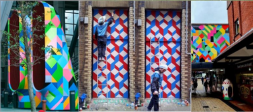
📍 Martins Way/Hitchin Road Underpass Wingwalls 💬 Colour 🎨 Carl Cashman: ART