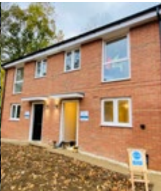
NEW HOMES FOR FAMILIES