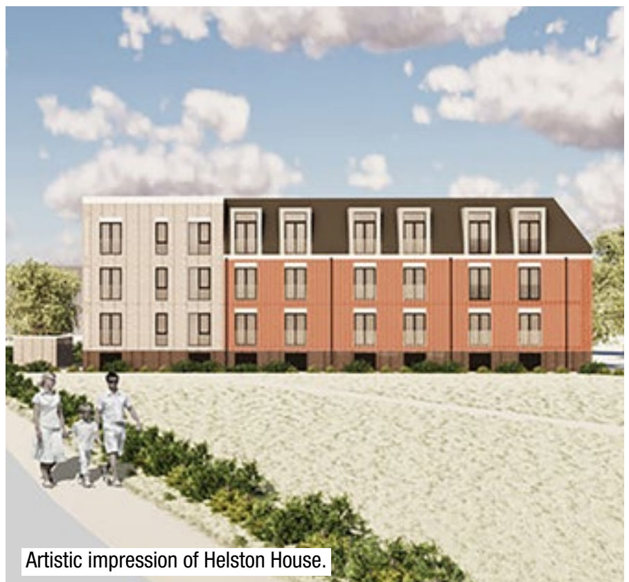
Artistic impression of Helston House.

Those two issues of sustainability and affordability for residents will continue to be championed by the Council through its housing development programme.