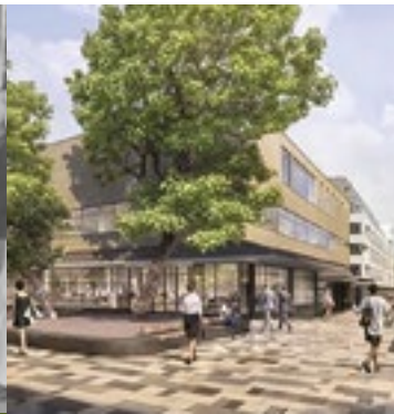
REGENERATING STEVENAGE TOWN CENTRE