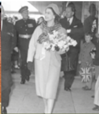
CELEBRATING THE QUEEN'S JUBILEE