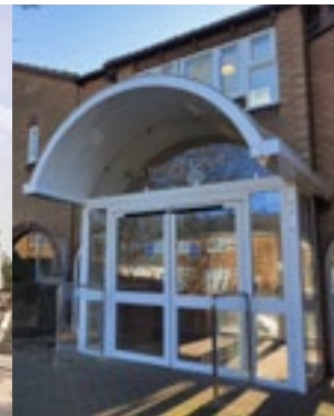
OUR INDEPENDENT LIVING PROPERTIES