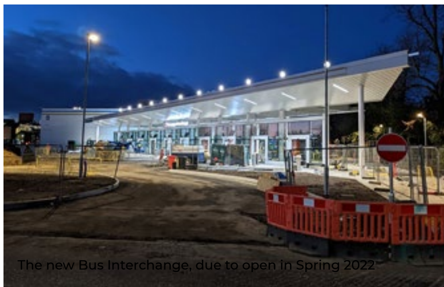
The new Bus Interchange, due to open in Spring 2022

Our ambitious plans to transform Stevenage town