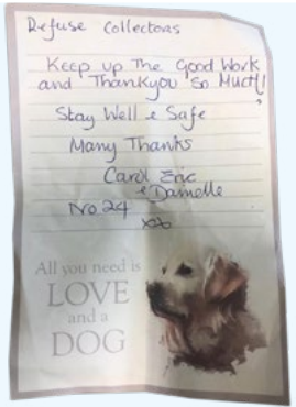
THANK YOU MESSAGES